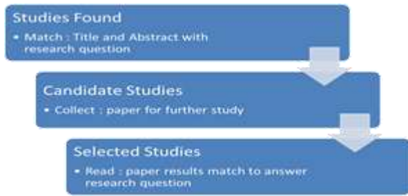
Figure 2: Inclusion Criteria

Data extraction process was started in September 2015 and examined 301 papers with search by keywords from the list above against the sources of literature. After reading the abstracts there are 177 papers which become candidates and after thorough readings and based on exclusion criteria there were 30 papers selected for review with the details as shown in Table 2.